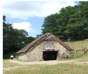
Bernadette's house, Bartres

The village , near Lourdes is famous for its association with St. Bernadette . She was sent there in her infancy to a wet nurse, and again in her early teens to work for the same lady as a shepherdess.